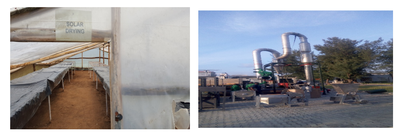
Figure 2: Cassava drying technologies: Solar drying in Uganda (left) flash drying in Nigeria (right)

Finally, drying technologies have been improved to cut down on weather dependent methods, minimise delays, move volumes and increase efficiency. These technologies range from solar drying in Uganda, bin drying in Ghana to the very expensive and efficient flash drying in Nigeria.